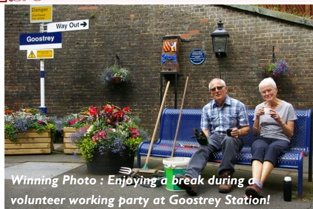
Winning Photo : Enjoying a break during a volunteer working party at Goostrey Station!