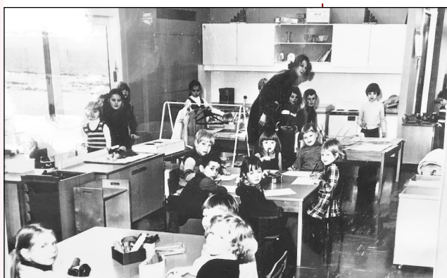
Picture from an early day in the school extension at the Village Hall.

The exhibition will include photographs of village life and images of children at the primary school from the Victorians to the sixties, seventies and eighties, as well as two canes and the punishment book which will be a reminder to some former pupils of their misdemeanours in class!