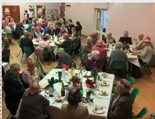
Nearly 100 people attended the Seniors' Lunch last year, make sure you get a ticket this year!

Each year the Parish Council hosts a lunch for the more Senior Residents of Goostrey at the Village Hall. This year we are again, offering a delicious 3 course meal with tea, coffee and water for £7 per head (those attending are welcome to bring their own drinks). Tickets are only available from the Parish Office from 1st November, call to book tickets on 535825. Please arrange to collect and pay for them within a week. There are only 100 tickets available so you need to be quick (only Goostrey Residents aged 65 years & over are eligible to attend).