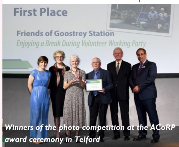
Winners of the photo competition at the ACoRP award ceremony in Telford