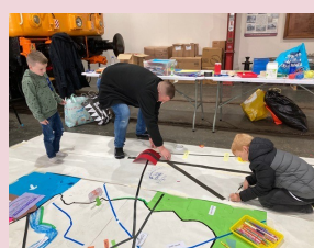
Adults and children creating a map of local railways during Community Rail week

encourage the switch from car to train for a healthier, more sustainable future.