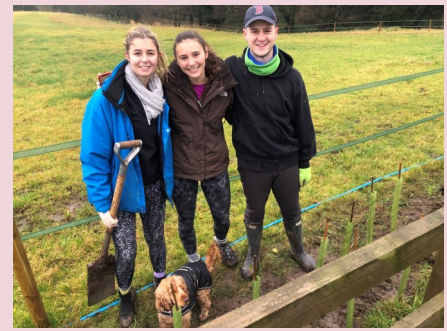
Volunteers at Swanwick December 2021

Bring your own spade along, and instructions on tree and hedge planting will be provided. Free tea and home made cake will be provided by Holmes Chapel Bridge the Gap.