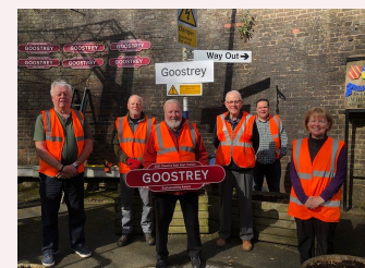
Volunteer Pride - celebrating a 7th win in the Cheshire Best Kept Station Competition