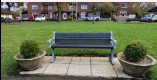
Booth Bed Lane Green

These have now been installed and are looking extremely smart. The seats themselves are made from recycled plastic and are therefore low maintenance, have a less harmful effect on the environment and should look good for many years to come.